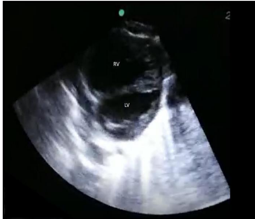
Figure 1b: Short axis parasternal view of the heart showing flattening of the interventricular septum towards the LV. RV: Right Ventricle, LV: Left Ventricle.