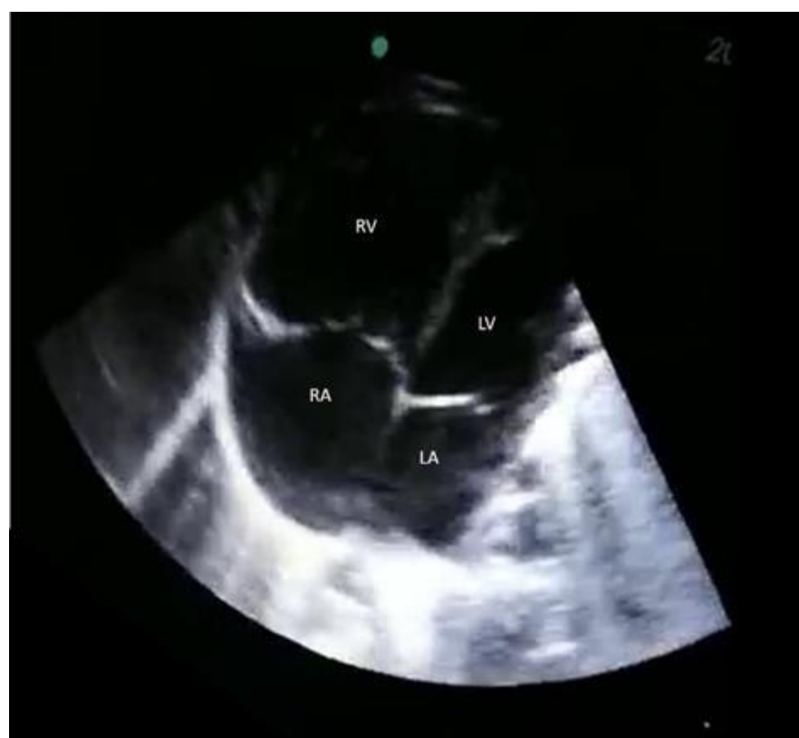
Figure 1a: Four chamber views of the heart: showing RV is bigger than LV.

When he was stabilized, surgical intervention was performed. The patient tolerated the procedure very well, and a follow-up after two months after the approach showed an excellent outcome.